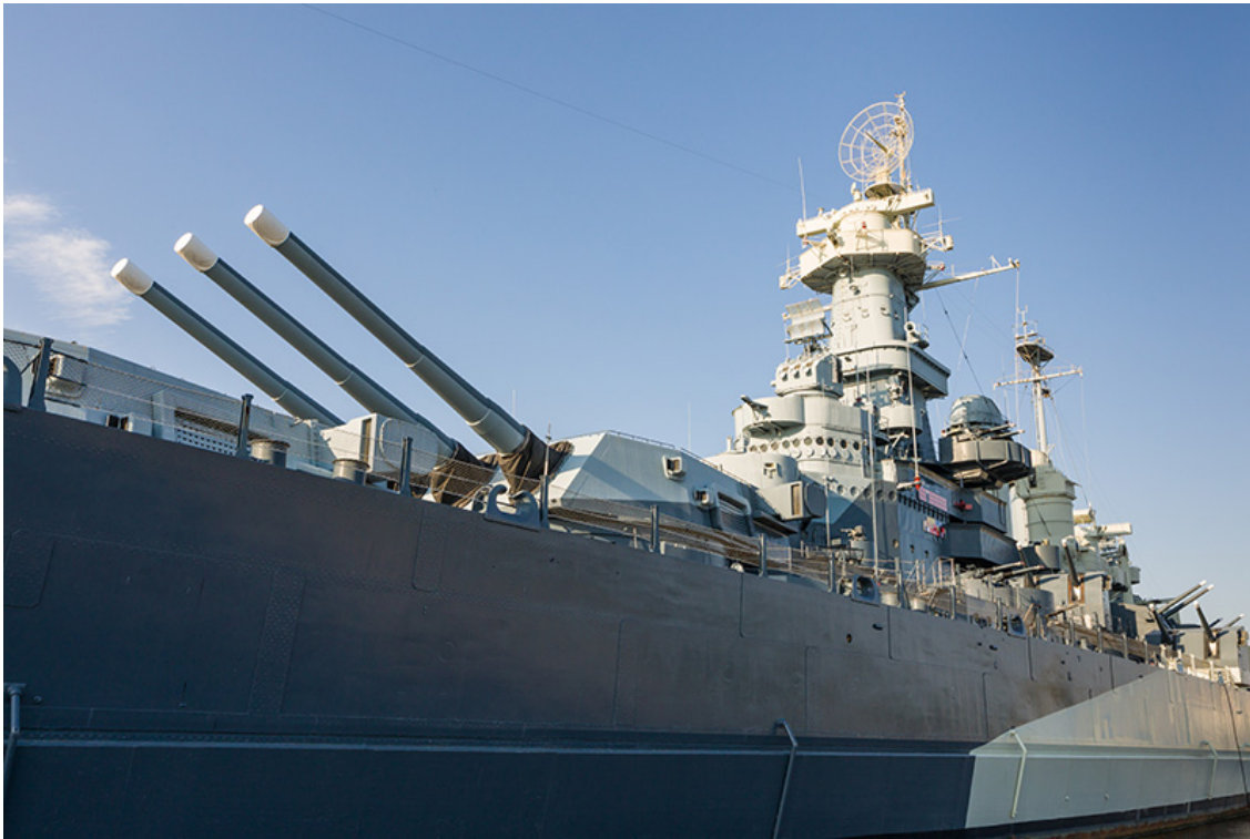
Photo credit: Denis Lemay for Battleship NORTH CAROLINA (High-res available at https://www.flickr.com/photos/battleshipnorthcarolina/ )